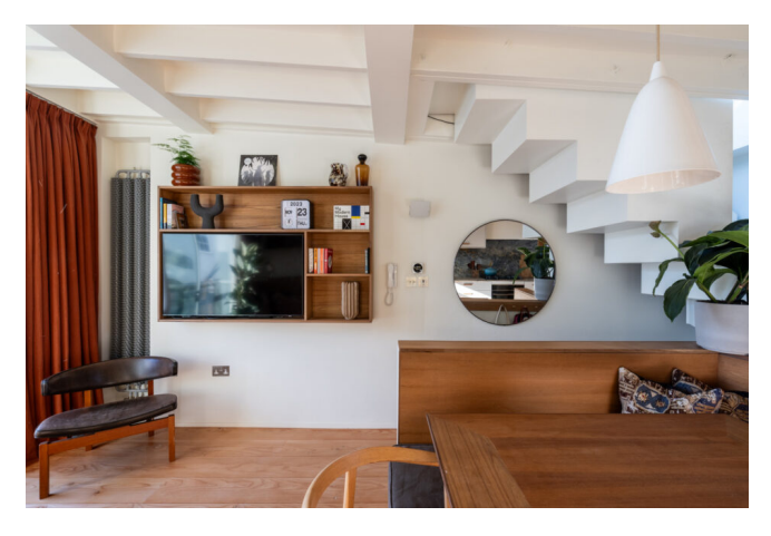
London, West London Sold