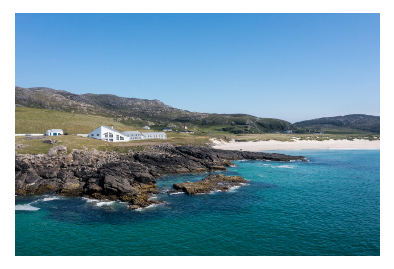
Tangasdale Beach, Isle of Barra £1,500,000 Freehold