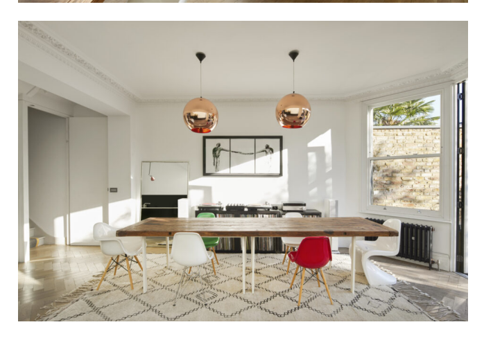
London, North London Sold