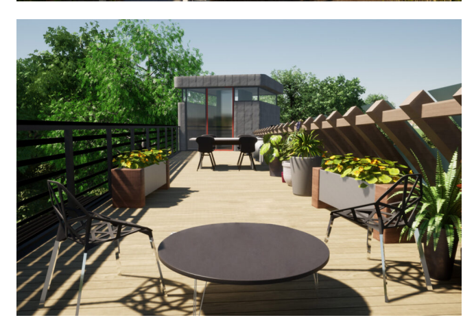
East Anglia £250,000 Freehold (plot of land with planning permission)