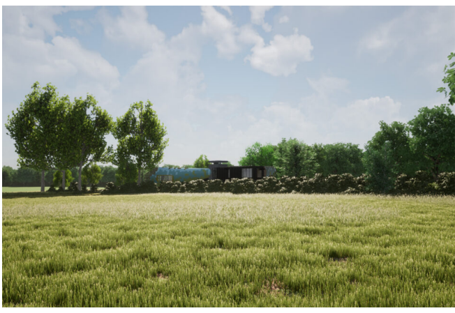
East Anglia £250,000 Freehold (plot of land with planning permission)