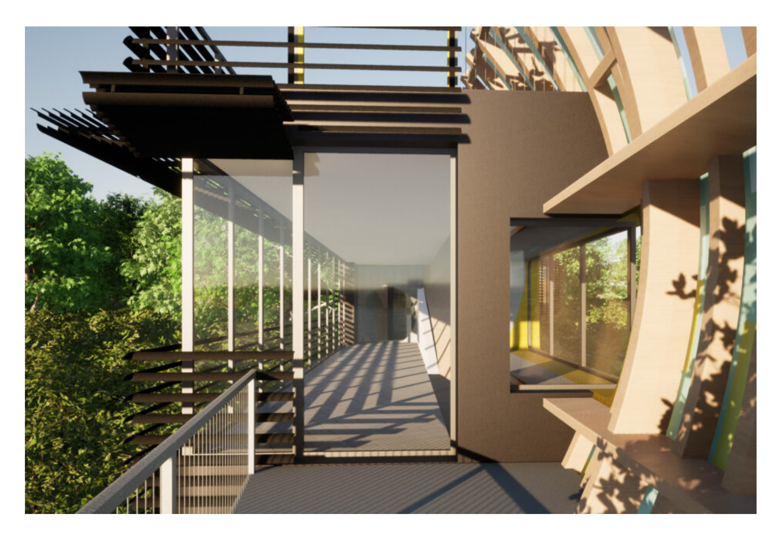
Castle Camps, Cambridgeshire £250,000 Freehold (plot of land with planning permission)